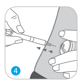
Remove injection needle.