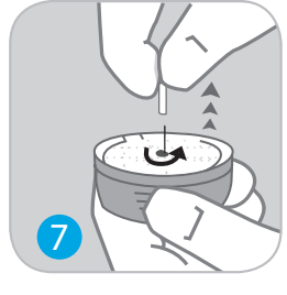
Twist and remove needle guard from introducer needle.