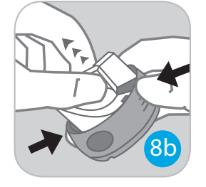
Put fingers on lined ridges then pull up on center of inserter until locked in upright position.