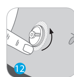
Secure adhesive pad to skin.