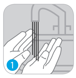
Wash hands with soap and water.